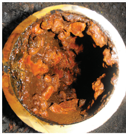
Watermain before cleaning. Corrosion and tuberculation restrict the flow of water.

This degree of cleaning is crucial for maximum liner bond around any service connection to ensure leak-free liner performance. The dry process also reduces waste generated by up to 98% and virtually eliminates downtime required for disposal. The process is completely en-