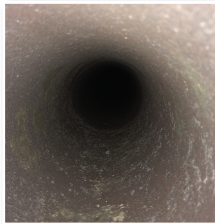
Watermain after dry Tomahawk cleaning. Pipe is restored to full capacity.

closed, so there will be nothing for curious residents to see during operation.